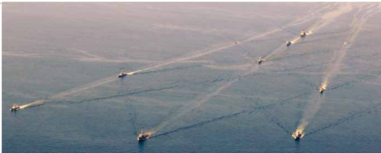
Ships from participating nations are in formation during exercise Sea Breeze 2011. Sea Breeze is the largest multi-national maritime exercise in the Black Sea region.

As a result of the divergent policy, NATO as a whole continues to struggle to find a common and credible policy for this strate-