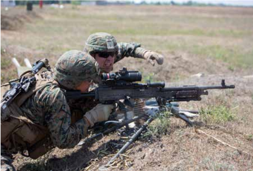
A US Marine with Rotational Force-Europe fires an M240B machine gun during “Sea Breeze 19” in Chabanka, Ukraine, 3 July 2019. “Sea Breeze” is a US and Ukraine co-hosted multinational exercise held in the Black Sea region and is designed to enhance interoperability.

gion against NATO Member States, even if such a probability appears low or some may even say remote. However, the illegal Russian annexation of the Crimea was one example of this happening. Therefore, we cannot ignore potential Russian military action in this region against NATO members and Russia will, as usual, deny any such action and present itself as a victim of any NATO initiated attack. However, it should be emphasised that after Crimea everything has changed and everything inconceivable has now become conceivable. The end result of the annexation of the Crimea led to a belated awakening and understanding in the NATO leadership that something needed to be done to change the situation. This resulted in the acceleration of NATO’s dormant engagement in the region as described below. The first step in the direction of NATO solidarity as a policy line was made in October 2017 when NATO inaugurated a new brigade-size multi-national NATO force with headquarters in Craiova, Romania, which was designed to counter Russia’s increased threat to South-East Europe following the illegal Russian annexation of the Crimea and continued intervention in east Ukraine. NATO Secretary General Jens Stoltenberg told a joint press conference with Romanian