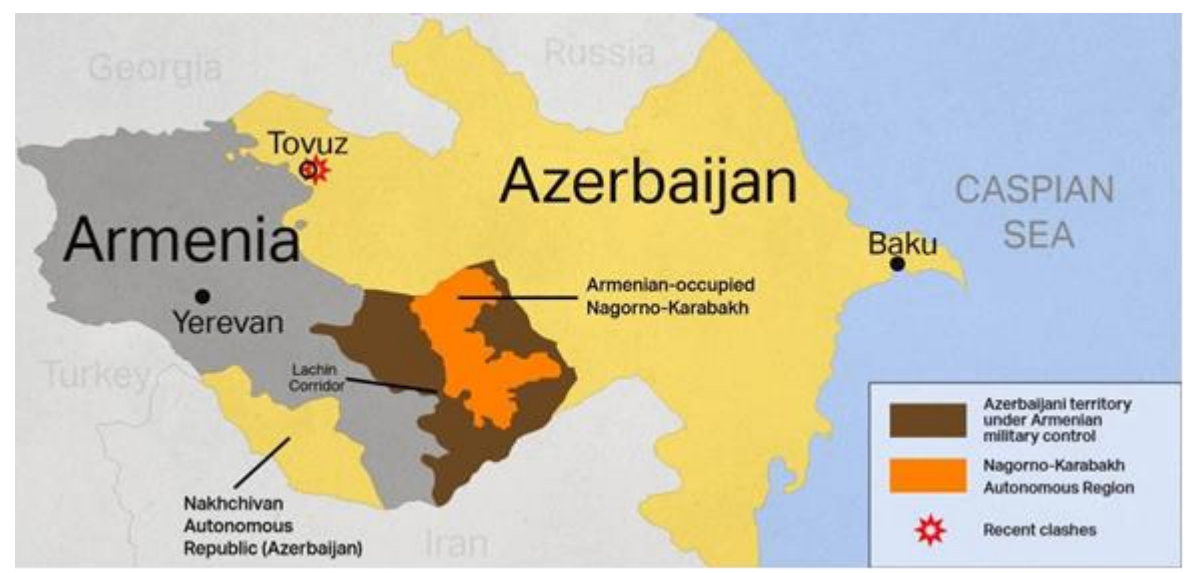
Picture 1. The place of escalation between Armenia and Azerbaijan<sup>1</sup>