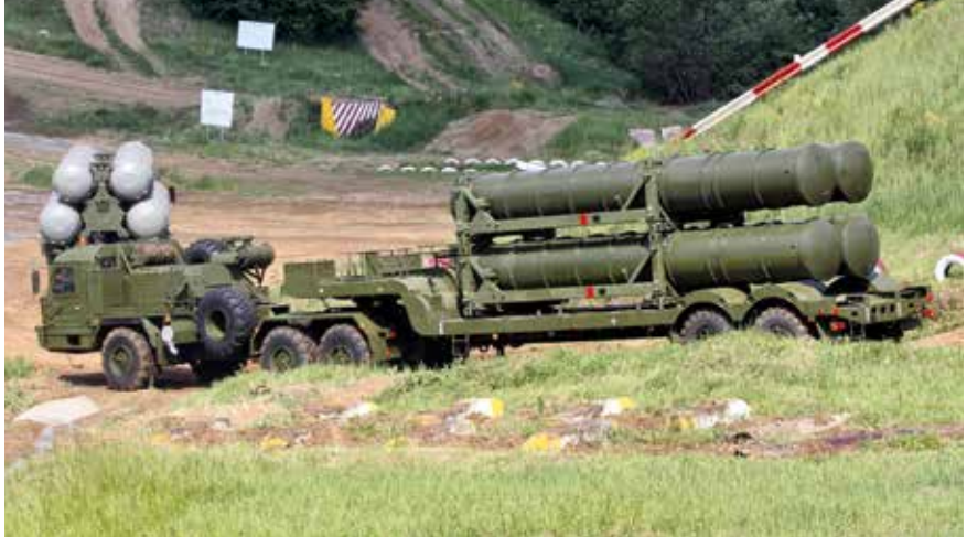
A Russian S-400 Air Defence System on a BAZ trailer chassis

In addition to Turkey's dependence on Russian gas and Russian tourists, the Russian-Georgian war in August 2008 sent a clear message to Ankara, namely that Ankara can only increase its influence in its immediate neighbourhood, namely in the Black Sea region, by coordinating with Moscow and not with its NATO allies. And that is exactly what has happened since then. Turkey's failed coup d'état on 15 July 2016 has further consolidated relations between Russia and Turkey. In a telephone call with Erdogan on 17 July 2016, Putin stressed the "categorical inadmissibility of anti-constitutional acts and violence in state life" and reaffirmed his intention to meet Erdogan in Russia. Putin's reaction was in stark contrast to that of the Western allies. Turkish Foreign Minister Mevlut Cavusoglu said on 25 July 2016: "Unlike other countries, we